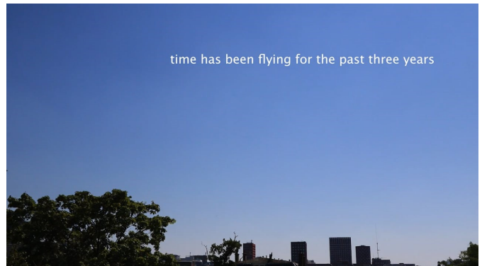
Himmel (2022) video still