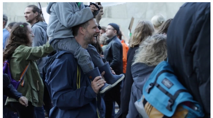
little did we know (2019/2023) video still