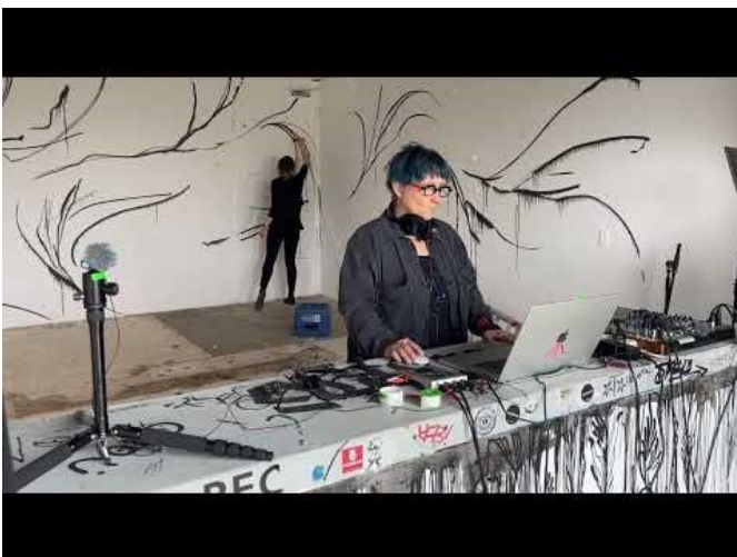
again and again and again (2022), ) video still Teufelsberg Domecast, Berlin (D)